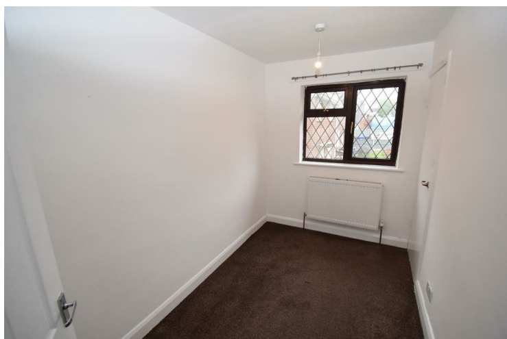
Bedroom 3 10'9" x 6'3" (3.30 x 1.93)

Third bedroom with a built in cupboard, radiator and leaded light double glazed front window.