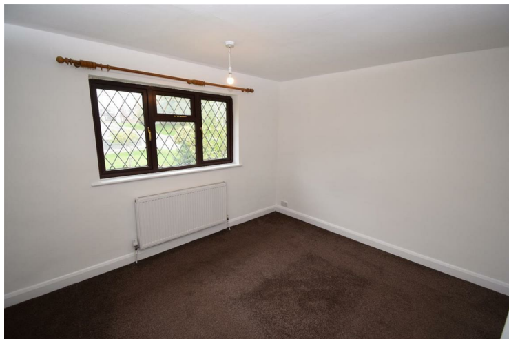
Bedroom 1 12'0" x 10'10" (3.66 x 3.32)

Front double bedroom with a radiator and leaded light double glazed window.