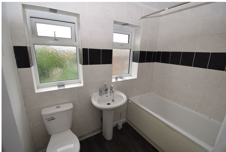
Bathroom 7'8" x 5'6" (2.36 x 1.69)

Three piece suite comprising bath, wash hand basin and WC. Tiled walls, a heated towel rail and two double glazed rear windows.