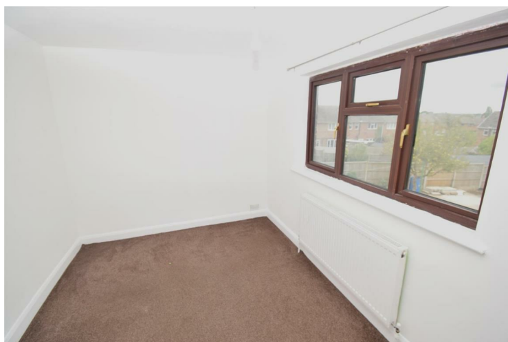
Bedroom 2 13'10" x 8'5" > 5'5" (4.23 x 2.58 > 1.67)

Rear bedroom with a radiator and double glazed window.